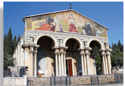
Church of All Nations